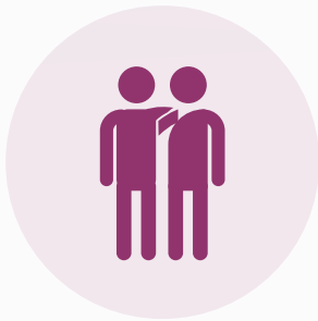
YOUTH AND YOUNG ADULT MINISTRIES