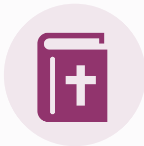
RELIGIOUS EDUCATION AND FAITH FORMATION