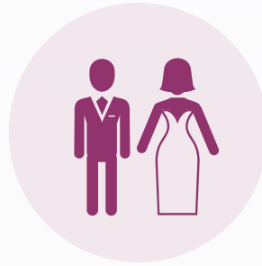
MARRIAGE AND FAMILY LIFE MINISTRY