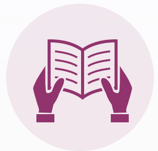
LITURGY AND MUSIC MINISTRY