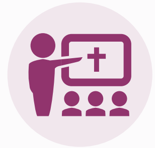
LAY MINISTRY TRAINING AND DEVELOPMENT